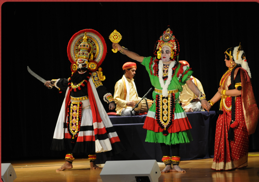
Yaksha Manjusha troupe performs “Panchavati: the story of Surpanakha” at UMBC, September 6, 2014